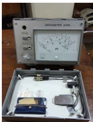
Fig. 1 - Ultrasonic instrument.

The thickness measures should be carried out in order to measure the thickness of intumescent paints applied to the protected element to check the compliance between the design and the reality. Moreover, a detailed survey of the thickness allow to group the structural elements into homogeneous categories, to simplify the assessment of the structural behavior in fire conditions. The evaluation of the thickness is regulated by the UNI EN 2808 which describes both investigation and data processing methods. Ultrasonic (Fig. 1) and optical (Fig. 2) instruments are widely used to measure the thickness. The first type has an ultrasonic transmitter and an ultrasonic receiver and the thickness of the paint is defined by measuring the propagation time of the waves through the layer to be measured. Non-invasiveness and high precision are advantages of using this instrument, but the process of instrument calibration, above all in situ, is extremely delicate. The optical instrument allows a direct measurement of the thickness practicing a slight cut on the painted element, up to reach the steel substrate. The blades are normalized and the thickness value can be read directly through a graduated microscope. The instrument is minimally invasive, and it can be considered a good tool to check the readings obtained by the ultrasonic one.