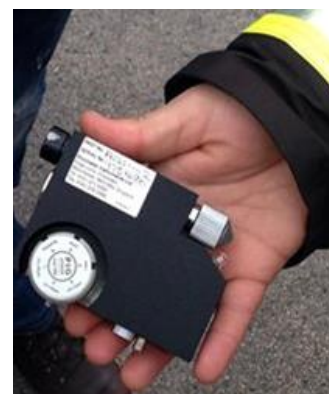
Fig. 2 - Optical instrument.